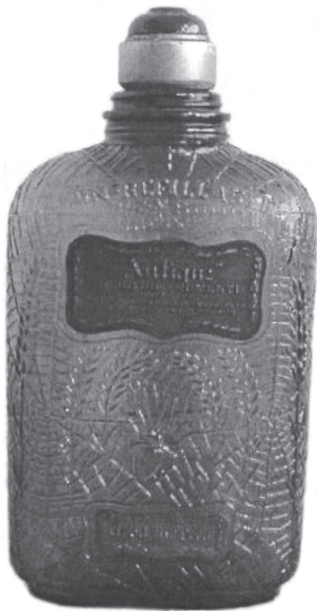
Figure 8: Frankfurt Distillery 1920s bottle of “medicinal” whiskey.

being one of a few firms that received permits to produce “medicinal” whiskey, which it sold as “spiritus frumenti alcoholic stimulant,” omitting the word “whiskey.” [Figure 8] Providing some 25 percent of the national supply, its literature later