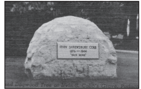
Figure 14: From a postcard, the Cobb grave site.

In the 62 years since his death he has become a forgotten man. Yet Irvin S. Cobb can be remembered with honor for his role in ending Prohibition, the "Great Experiment" that became a great disaster.