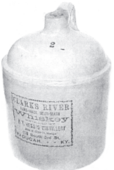
Figure 5: "Clark's River" Whiskey, from H.T. Hessig Distillery, Paducah.

and much too good for many of the others."