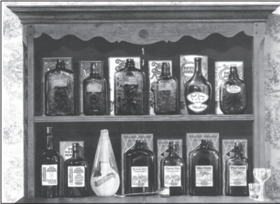
Figure 12: The centerpiece of the Cobb Recipe Book.