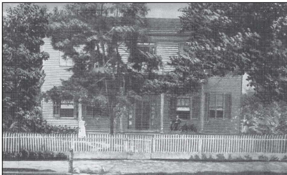
Figure 2: From a postcard, the birth place of Irvin S. Cobb. The house was torn down in 1914.

National Prohibition also fell hard on Cobb. At first he dealt with it humorously, writing that: "Since Prohibition came in and a hiccup became a mark of affluence instead of a social error as formerly, and a loaded flank is a sign of hospitality rather than of menace, things may have changed." And again: "Booze is a bad thing for some people