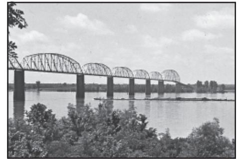
Figure 7: From a postcard, the Cobb Bridge over the Ohio River.

After Repeal, only a handful of the pre-1920 distilleries were able to reopen. Among them was the Frankfort Distilleries. Founded after the Civil War in Atlanta by Paul Jones, a whiskey salesman, the operation was moved to Louisville, Ky. in 1886. It survived during Prohibition by