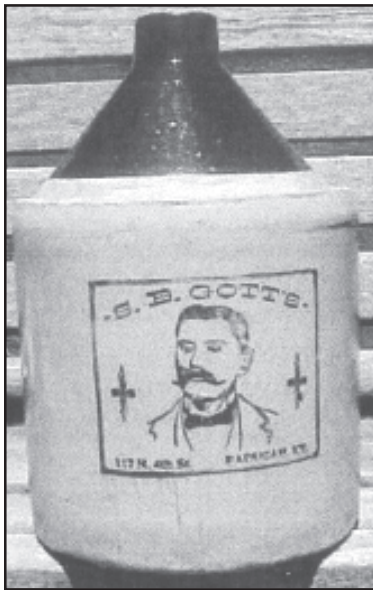
Figure 4: S.B. Gott jug, Paducah.