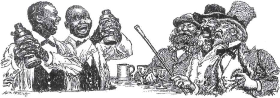
Figure 13: An illustration from the recipe book.

Americans. In 1941 his national column, which had run continuously since 1922, was canceled. In failing health throughout the early 1940s, Cobb, 68, died on March 10, 1944. He was buried in Paducah's Oak Grove Cemetery. The inscription on his stone says simply "Irvin Shewsbury Cobb, 1876-1944, "Back Home" [Figure 14].