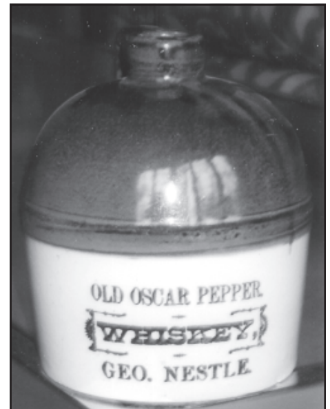
Figure 10: An Old Oscar Pepper jug.

A 1937 movie he wrote was a critical and popular flop. The New York Times wrote: “Mr. Cobb...presents the appalling spectacle of a man who is not merely beyond his depth but insists on showing off as he goes down for the third time.” Increasingly he began to espouse conservative causes and to write demeaningly about Negro