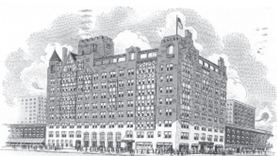
Figure 6: From a postcard, the Irvin S. Cobb Hotel, Paducah.

Espousing the anti-Prohibition cause seems only to have enhanced Cobb's popularity. On April 30, 1929, the Irvin Cobb Hotel, the largest and most