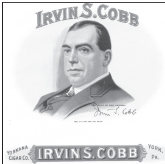
Figure 1: From the lid of an Irvin S. Cobb cigar box.