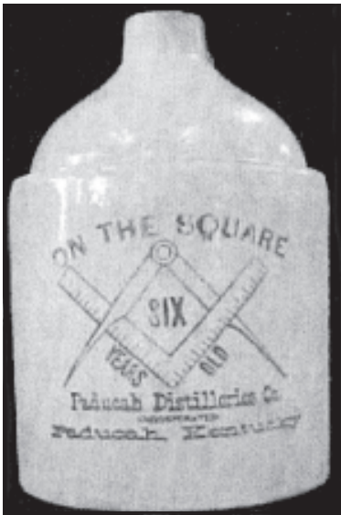
Figure 3: "On the Square" Whiskey, Paducah Distilleries.